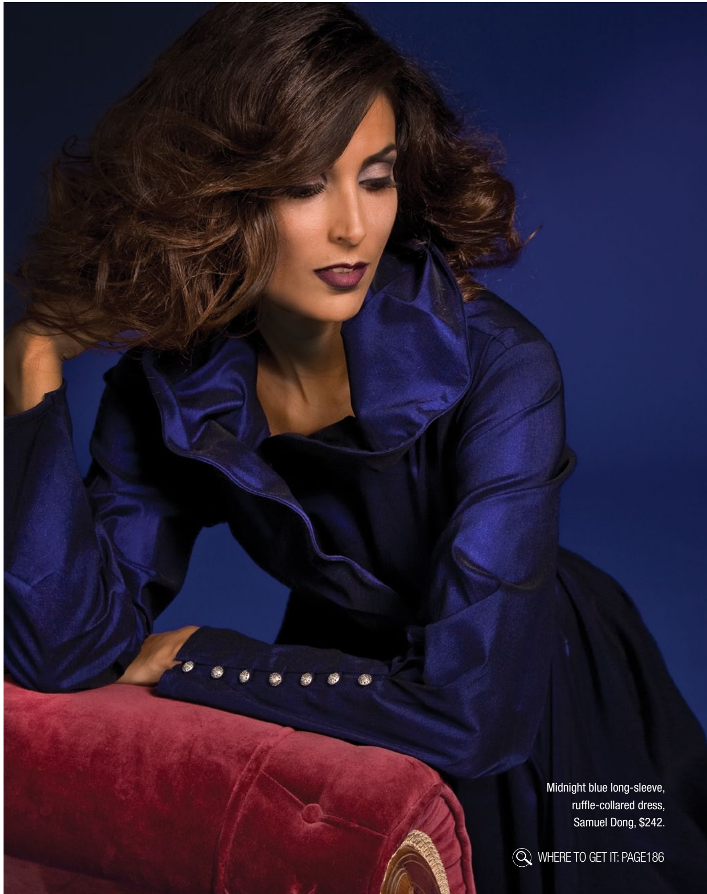
Midnight blue long-sleeve, ruffle-collared dress, Samuel Dong, $242.