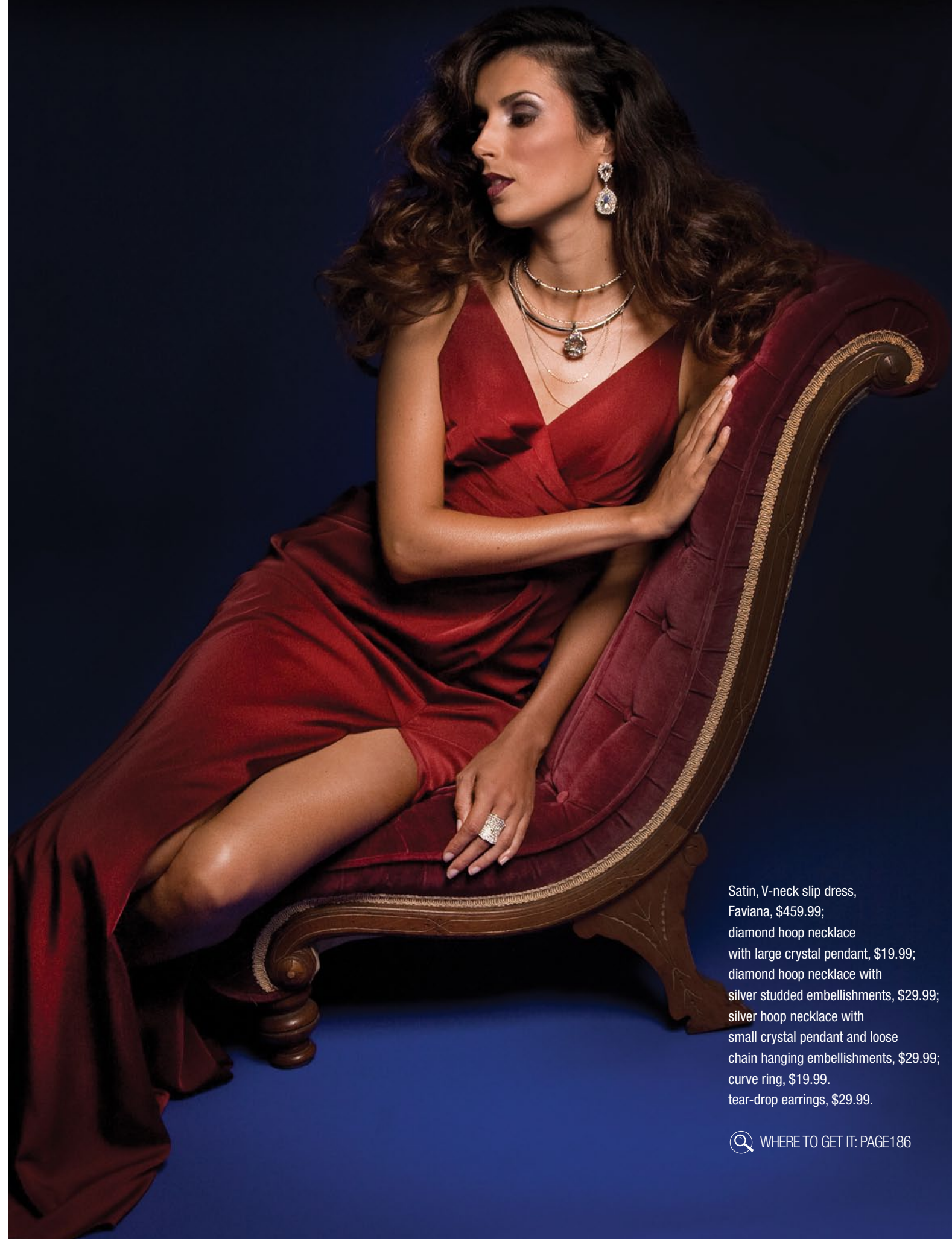
Satin, V-neck slip dress, Faviana, $459.99; diamond hoop necklace with large crystal pendant, $19.99; diamond hoop necklace with silver studded embellishments, $29.99; silver hoop necklace with small crystal pendant and loose chain hanging embellishments, $29.99; curve ring, $19.99. tear-drop earrings, $29.99.